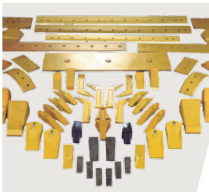
Ground Engaging Tools (G.E.T).