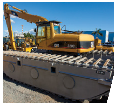
Amphibious Excavator Base