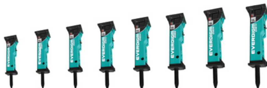
EHB008 EHB01 EHB02 EHB03 EHB04 EHB05 EHB06 EHB10

Qld Rock Breakers provides a value for money solution for all budgets, ensuring you get the right tool for your application. We have a complete range of new Everdigim (Rhino) Rock Breakers to suit from 0.5 tonne to 120 tonne excavators. As an option, we also offer short and long term hire, as well as a good quality used and reconditioned rock breakers