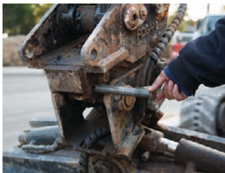
Photo 2: Shows a worker locating the safety pin for the semi-automatic quick hitch. This is an administrative measure, as it depends entirely on the action of the worker.

Further information can also be obtained within the Safe Work Australia Interpretive Guideline – Model Work Health and Safety Act: The meaning of ‘reasonably practicable’ . The model code of practice Managing Risks of Plant in the Workplace , also provides guidance on these concepts, refer section 2.3, Controlling of risks. These documents can be accessed at safeworkaustralia.gov.au