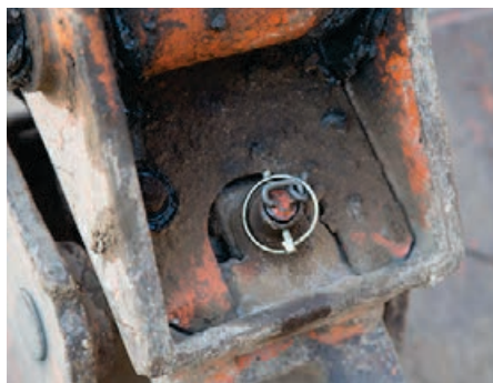
Photo 3: Another type of safety pin, in place and secured by a lynch pin to prevent it coming loose.